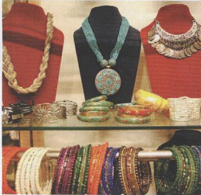
HOLIDAY DELIGHTS From left: Beaded jewelry at Khan Market's Jay Raj Arts, in Lutyens' Delhi; New York City's Fifth Avenue; the patio at the recently opened W Retreat & Spa, in Vieques.

Fog shrouds the early morning yoga classes in the Lodi Gardens where insiders practice their dawn asanas as I make my way to Khan Market , in Lutyens' Delhi. It's a place I discovered by chance on my first trip to India when the concierge of the Taj Mansingh Hotel sent me to the nearest ATM. Then as now, the market is a postcolonial time capsule, where even the priciest new stores retain a raffish charm. Who can resist the turquoise gift wrap festooned with gold-leaf Hindi script at Anand Stationers ? The owner totes up my holiday purchases on a pad with carbon paper inserts as if it were 1956. At Fabindia , I find housewares and silk fabrics, tablecloths, and kurtas. Nearby, Bahrison's booksellers is stacked with volumes dating back 50 years, while Jay Raj Arts