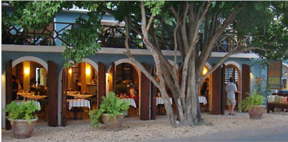
El Quenepo serves modern Puerto Rican cuisine on the ocean.