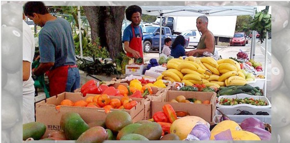
The Placita Reyes farmers’ market offers fresh fruits and locally made breads, cakes, and cookies.